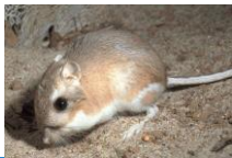
kangaroo rats are small rodents that live in American deserts

A nocturnal animal is an animal that is awake during the night and sleeps during the day. Some animals are nocturnal to hide from predators whilst others are nocturnal because they live in hot places such as deserts . Many animals, such as foxes and barn owls, are usually nocturnal but if they cannot find enough food then they will hunt during the day.